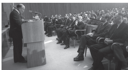
Slovenian Parliament adopting the Constitution, 23 December 1991

A team at Slovenian Institute of Contemporary History has completed an online project on drafting and adopting a new constitution for independent Slovenia in 1990–1991. Besides historical and legal context and detailed chronology, the website contains countless documents, including the archives of the Commission for Constitution Drafting.