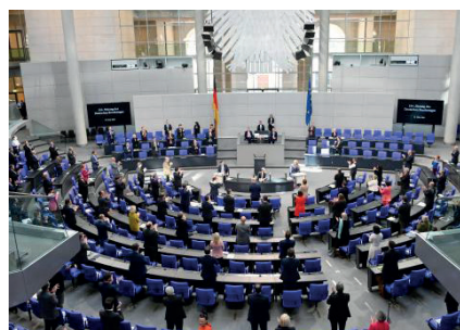
The quarantining German Bundestag on March 25, 2020